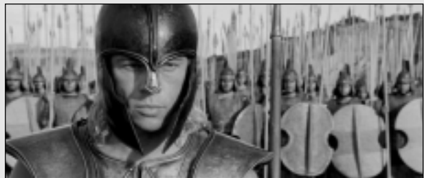
• Achilles (Brad Pitt) prepares to lead his army in attacking Troy in Troy (2004).

"Spider-Man 2" is in another category: It's a real movie, full-blooded and smart, with qualities even for those who have no idea who Stan Lee is. It's a superhero movie for people who don't go to superhero movies, and for those who do, it's the one they've been yearning for. 13