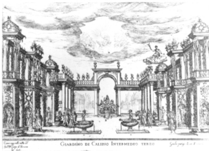
Figure 3 Giulio Parigi, 'Il Giardino di Calipso', third intermezzo to Michelagnolo Buonarroti's pastoral Il Giudizio di Paride , Florence, 1608. Etching, British Library, London [745.a.4], reproduced by permission of the British Library.

dangling down: others were cover'd flatt and had flower pots of gold for finishing: behind these appear'd the tops of slender trees, whose leaues seem'd to moue with a gentle breath comming from the farre off Hills. [ Tempe Restored , pp. 3–4]