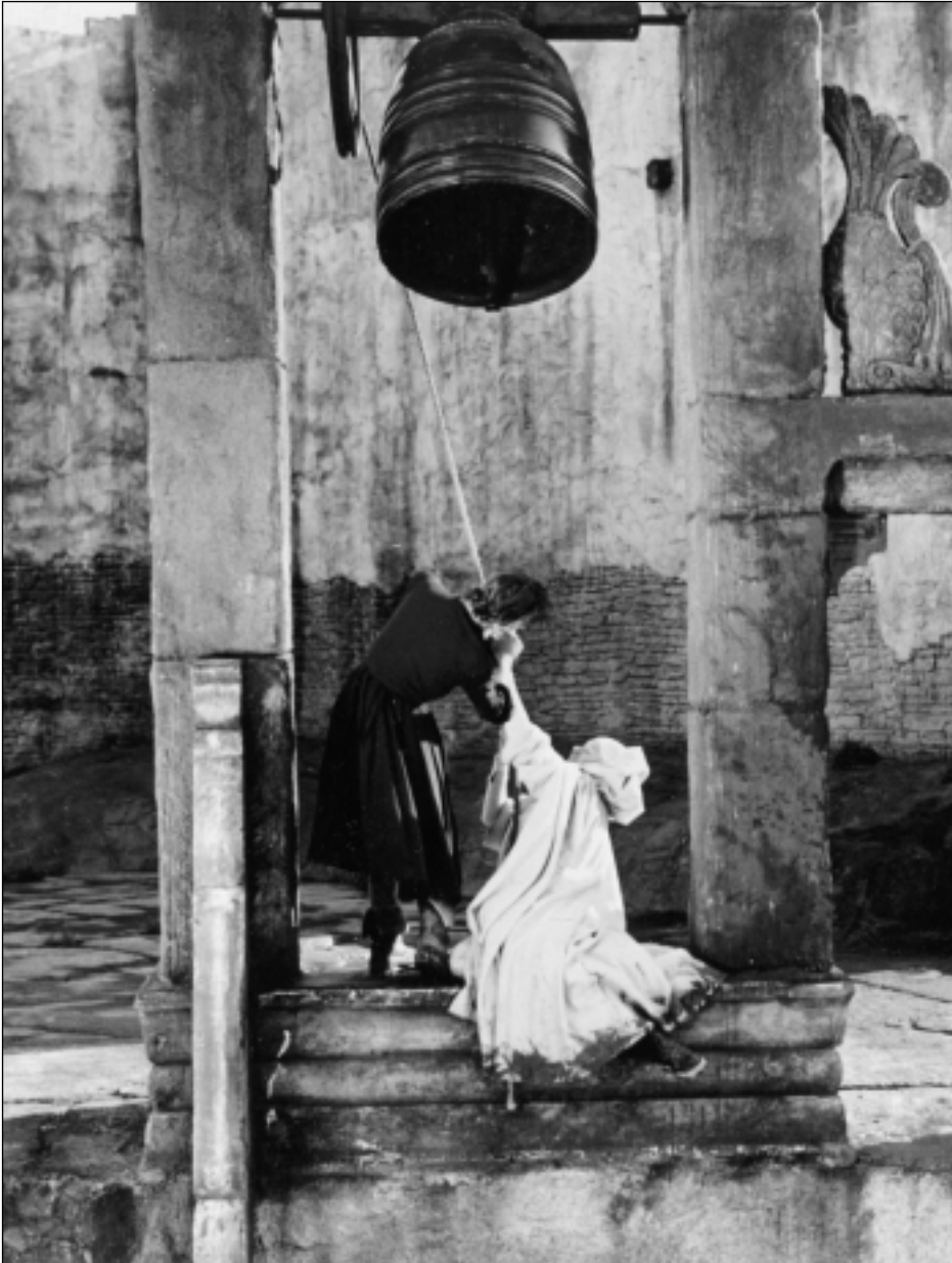
• Black Narcissus : Calling the imperialist civilising mission into question.

intellectual superiority and in ensuring that Indian subjects would work for, and not against, their imperial masters. While the value of